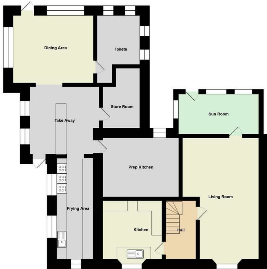
The Galleon and Mounts Bay House Ground Floor