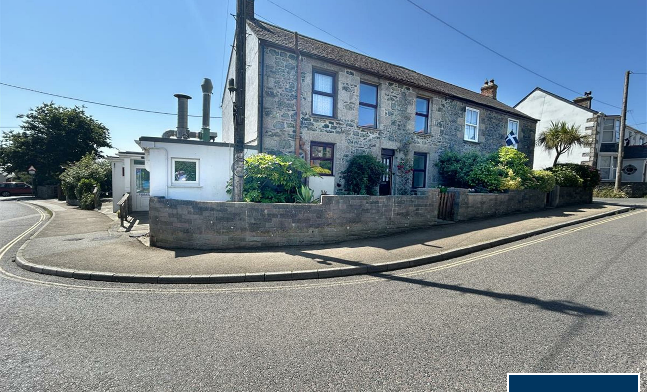
Mounts Bay House and attached business premises, Mullion, £350,000 Freehold