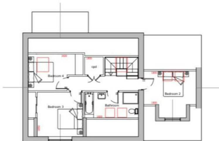
FIRST FLOOR PLAN GIA: 57.5m 2