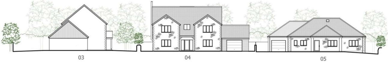
STREET ELEVATION: Plots 03 - 05