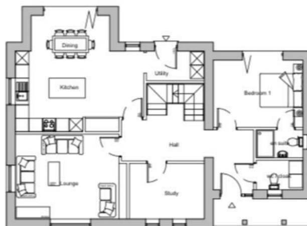
GROUND FLOOR PLAN GIA: 92.5m 2