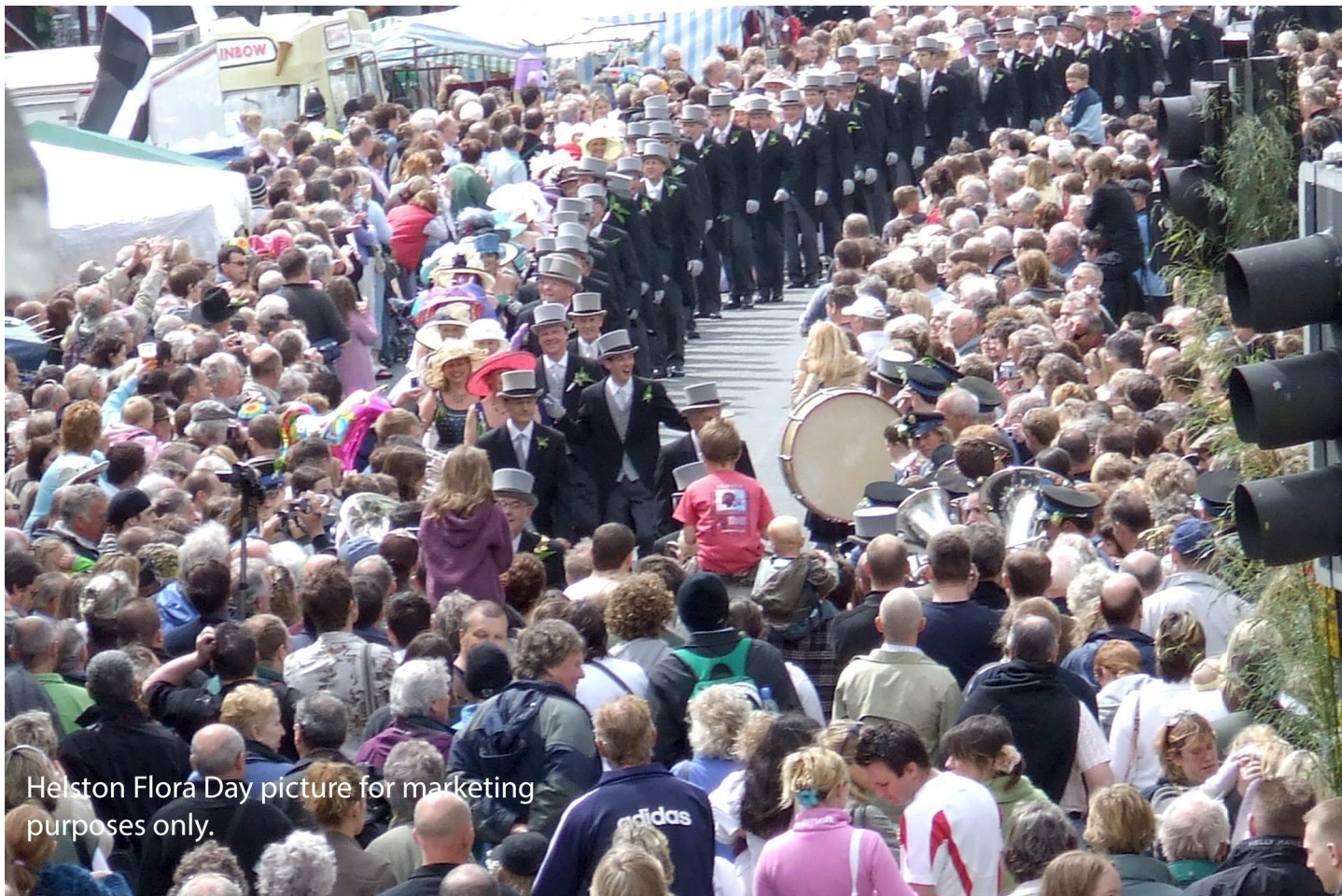
Helston Flora Day picture for marketing purposes only.