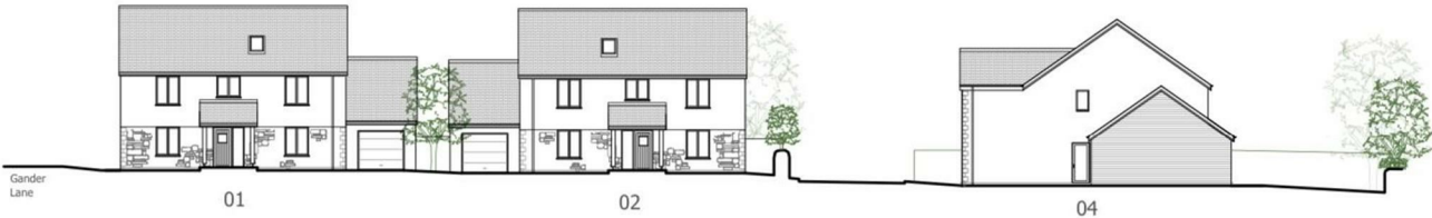
STREET ELEVATION: Plots 01, 02 + 04